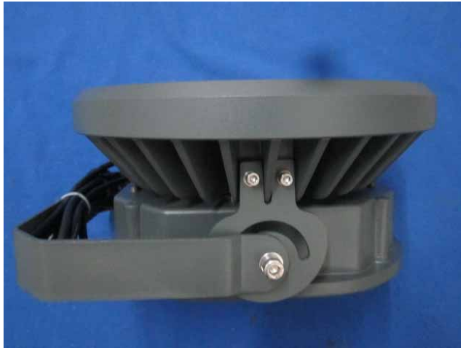
Photo 4 General Appearance of the EUT