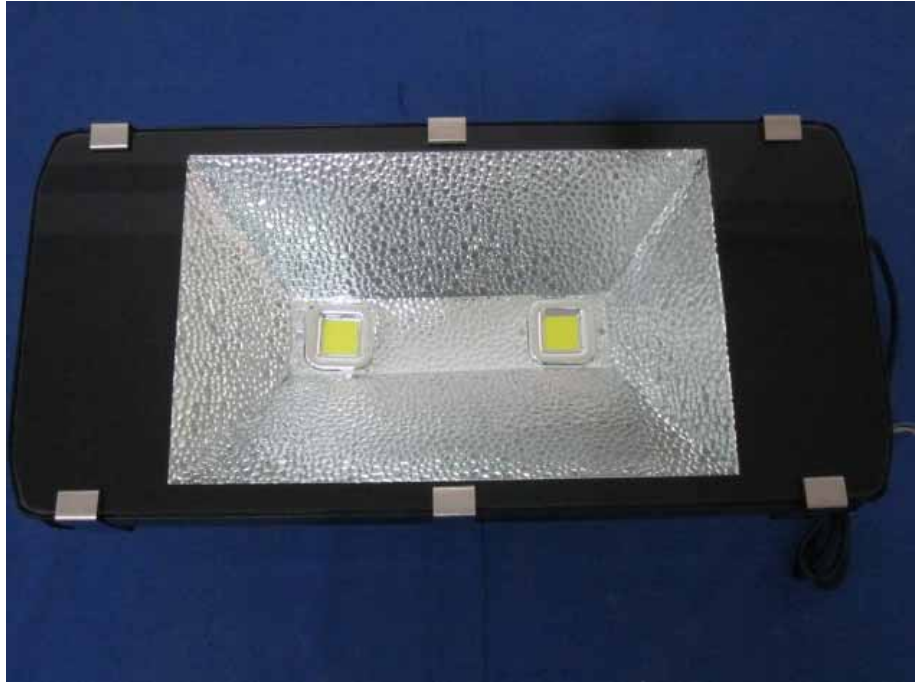
Photo 2 View of EUT